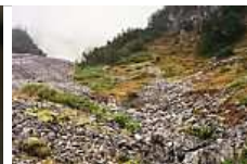
The art of camouflage – spot the sniper 19 Feb 2014