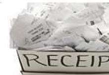
10 facts you should know about your consumer rights (My Family Club)