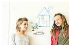
Too many first-time buyers blow their home-buying budgets (Money Advice Service)