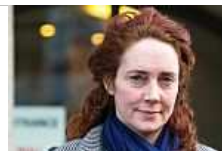
Phone-hacking trial: Rebekah Brooks in tears over 'car crash' private life 21 Feb 2014