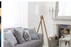
Get the look: Nordic Folk (Sainsbury's)