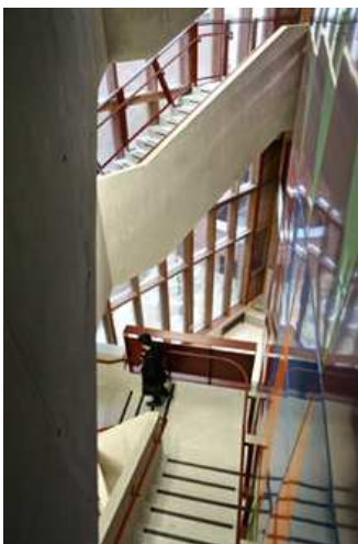
An interior shot of the centre.

A literal product of its surroundings, the form was then sculpted according to views down the narrow winding streets, such as from Lincoln's Inn Fields and St Clement's Lane, the folds of its facade determined by diagonals between pavements and rooftops. The result is a shapeshifting mass, chiselled into its form by an intricate web of urban ley lines.