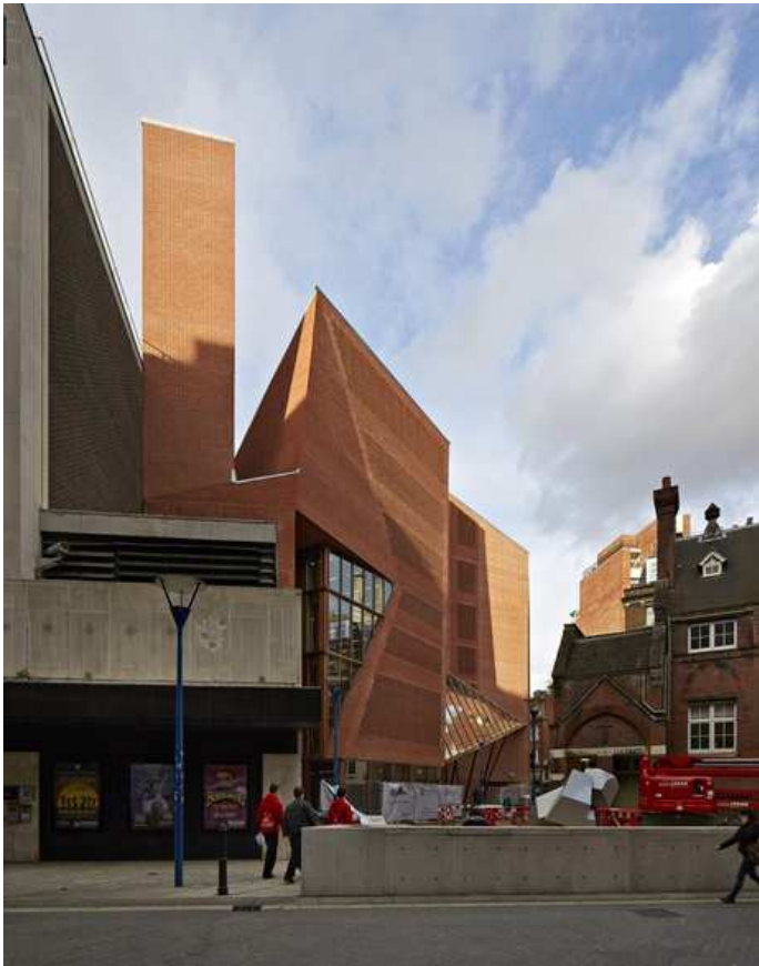
The exterior of the

Saw Swee Hock Student Centre.