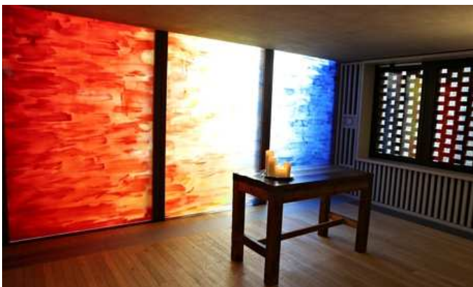
The Sacred Desert

As much attention has been given to crafting the plan, which feels entirely different from floor to floor, as the material qualities of the building, which are cast and moulded with a rare attention to detail. The curving walls that enclose the stair are formed from gnarled "elephant hide" concrete, ground to a sheen on the surface like nougat. The stairs and floors are of cast terrazzo and oak, with metalwork in the practice's trademark red oxide finish, while the brick skin dissolves into a perforated screen in places, providing privacy and shading, and giving the place a slightly Moorish feel. The lift core is clad in a jazzy wrapping of enamel panelling that cycles through harlequin segments, recalling the flags of exotic nation states as you skip between floors. It is a complex collage of things that are both rough and polished – as O'Donnell puts it, it is "warehouse meets gentleman's club".