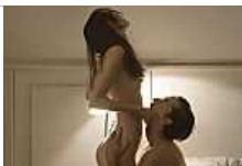
From Nymphomaniac to Stranger By the Lake, is sex in cinema getting too real? 21 Feb 2014